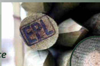
Cross section showing treatment penetration